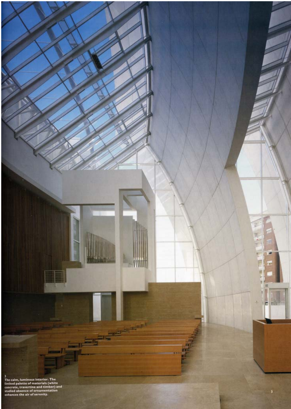
3 The calm, luminous interior. The limited palette of materials (white concrete, travertine and timber) and studied absence of ornamentation enhances the air of serenity.